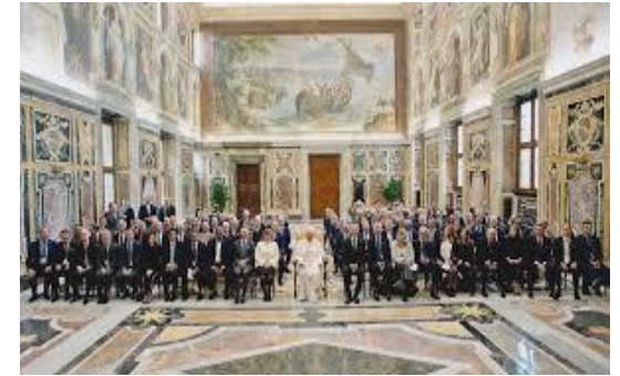
Pope with world business leaders

Mark of the beast 54-0513 P:80 If we'd take the history, and go right back and show it, where the kings had fallen in Rome, since the Babylon kingdom. ... one is... (Nero)... and one is to come;... and he must continue a short space... (about six months when he comes.) And the beast... (Oh. Look at this. Now, the power is going to take the pagan place.) And the beast that was, and is not, even... is the eighth,... (now watch)... and is of the