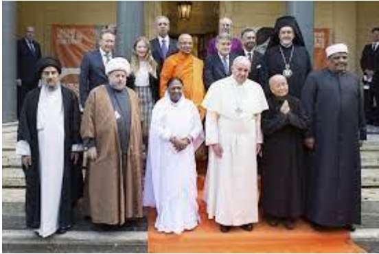
Pope with World Religious leaders

tell me a dictator that doesn't lean towards communism. See? And they shall what? "Hate the whore," the woman, the church. But watch. Watch what's going to do it... these shall hate the whore, and shall make her desolate and naked, and shall eat her flesh, and burn her with fire. Now who's going to do that? Who's going to burn her with fire? Putin? Who's going to do it?