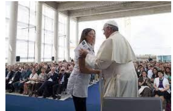
Pope in Pentecostal church

Why are we not a denomination? 58-0927 P:45 I've often heard that over the throne of the pope of Rome, it's wrote, " Vicarius Filii Dei. " I often wondered if that was true. Draw a line, and draw it up in figures in Roman numerals, and see if it is. It's exactly the truth. I stood that close to the triple crown of the pope in a glass: Jurisdiction of hell, heaven, and purgatory. See? So, those things, I've just come from there, just come from Rome and know it's the truth. Now, we know it's pictured out. And here the seven kings: five are fallen... (which was at that time),... and one is... (That's the one that come now, which was Caesar.),... and another is yet to come... (which was Niro, which was wicked);... Now watch, watch how perfect it is.... and when he cometh, he must continue for a short space. Does anybody know how long Niro reigned? Six months. Pulled his mother through the street on a single tree of a horse, and burnt the city, and laid it onto the Christians, and fiddled on the hillside while they were burning the city. Six--six months. And see, "And the beast..." Now watch, look what a rascal that he was.