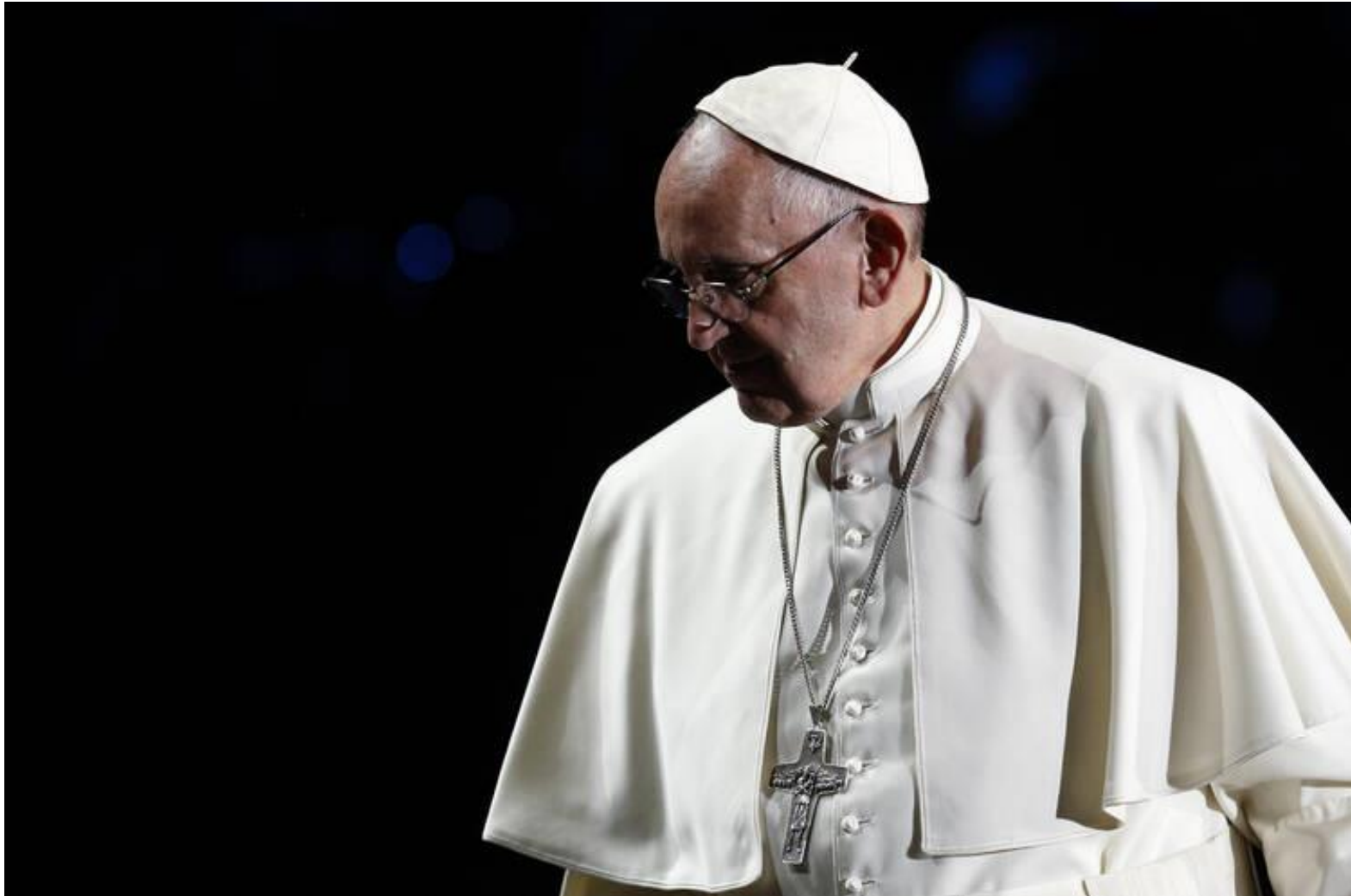
Pope Francis attends an ecumenical event at the Malmoe Arena in Malmoe, Sweden, Oct. 31.