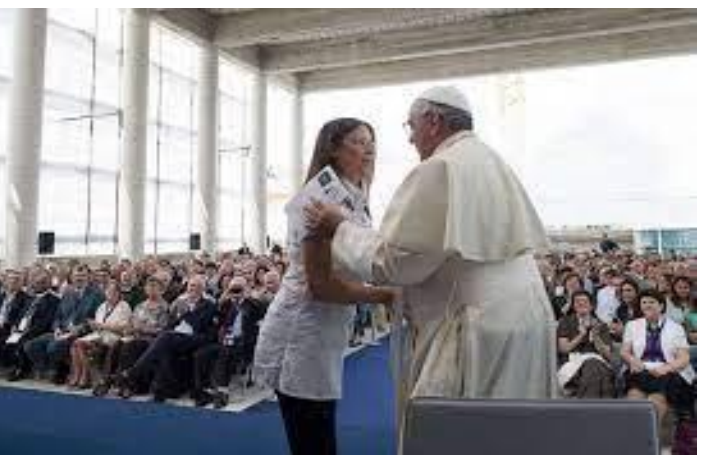
Pope in Pentecostal church