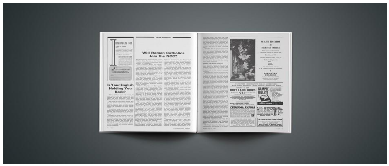
Will the Roman Catholic Church (membership: 46 million) join the National Council of Churches (constituent membership: 41.5 million)?

Look at the headlines in 1967? Will Roman Catholics Join the National Council of Churches? FEBRUARY 3, 1967. That was the headlines back in 1967 and just 2 years after the prophet of God was taken from us. And how many people stood with the Prophet of God?